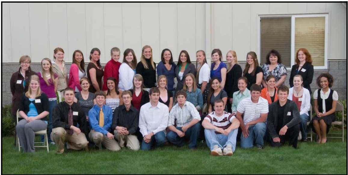
Awards Night 2009 Scholarship Recipients

Mark your calendar for our next Awards Night - Tuesday, May 18, 2010.