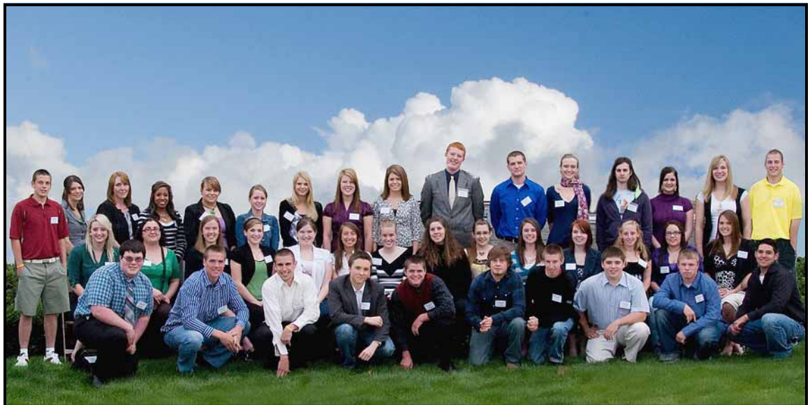
Awards Night 2010 Scholarship Recipients

Mark your calendar for our next Awards Night - Tuesday, May 17, 2011.